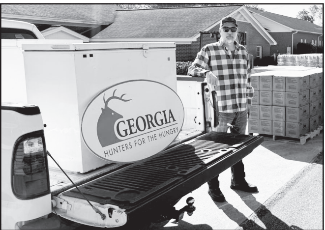
Donated Deer